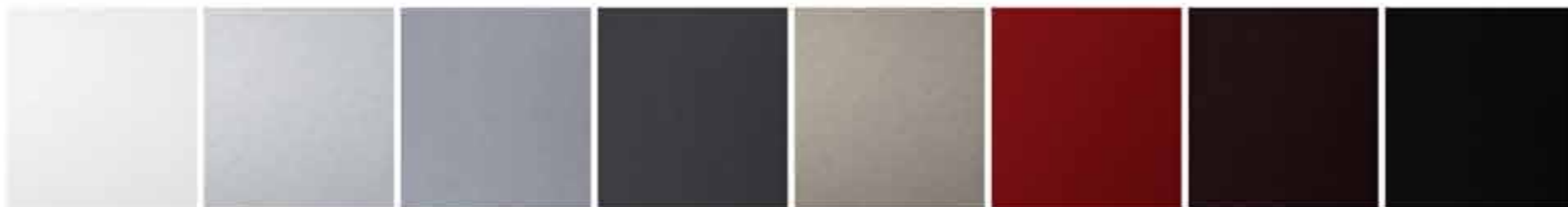
WHITE CRYSTAL WHC