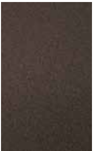
Arabian mocha N8N