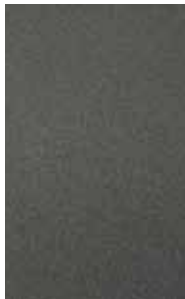
Titanium silver T6S