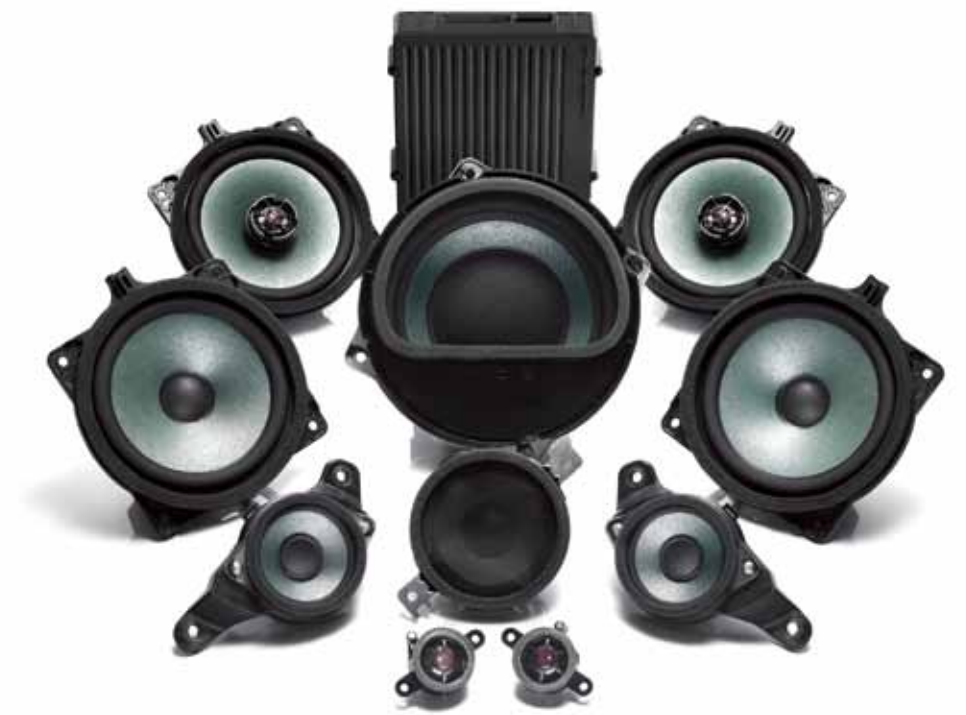
Premium sound system (only with Navigation)