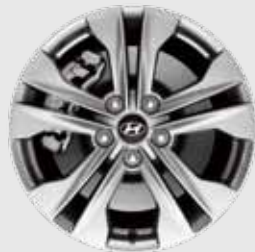
7.0JX17 Alloy wheels

Built-in heat coils improve visibility even in bad weather. Power folding makes operation convenient. Moreover, puddle lamps deliver side repeater and welcome features for excellent design and functionality.