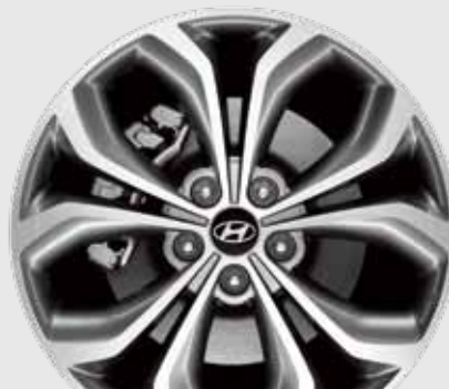
7.5JX19 Alloy wheels